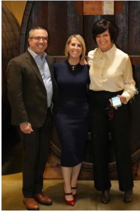
Organising team Satellite