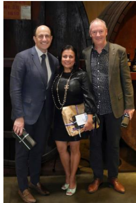
Organizing team AGM