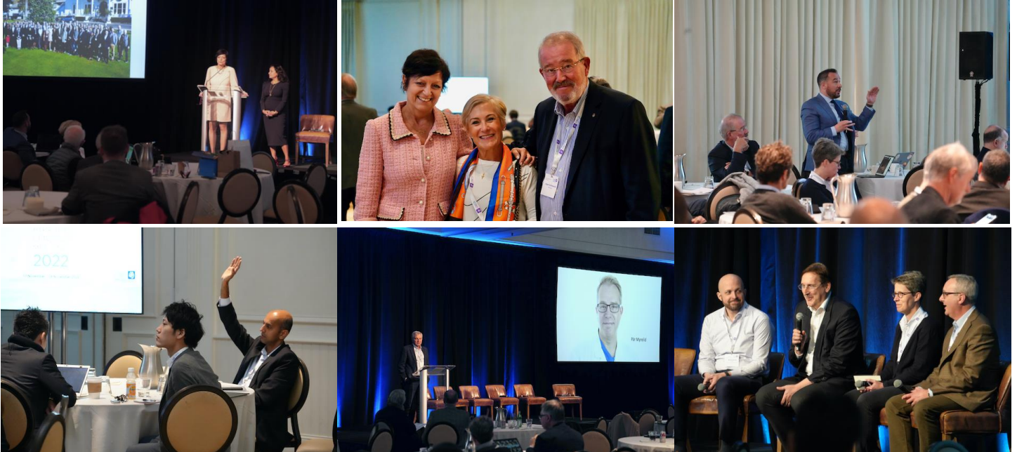
meeting room and interaction