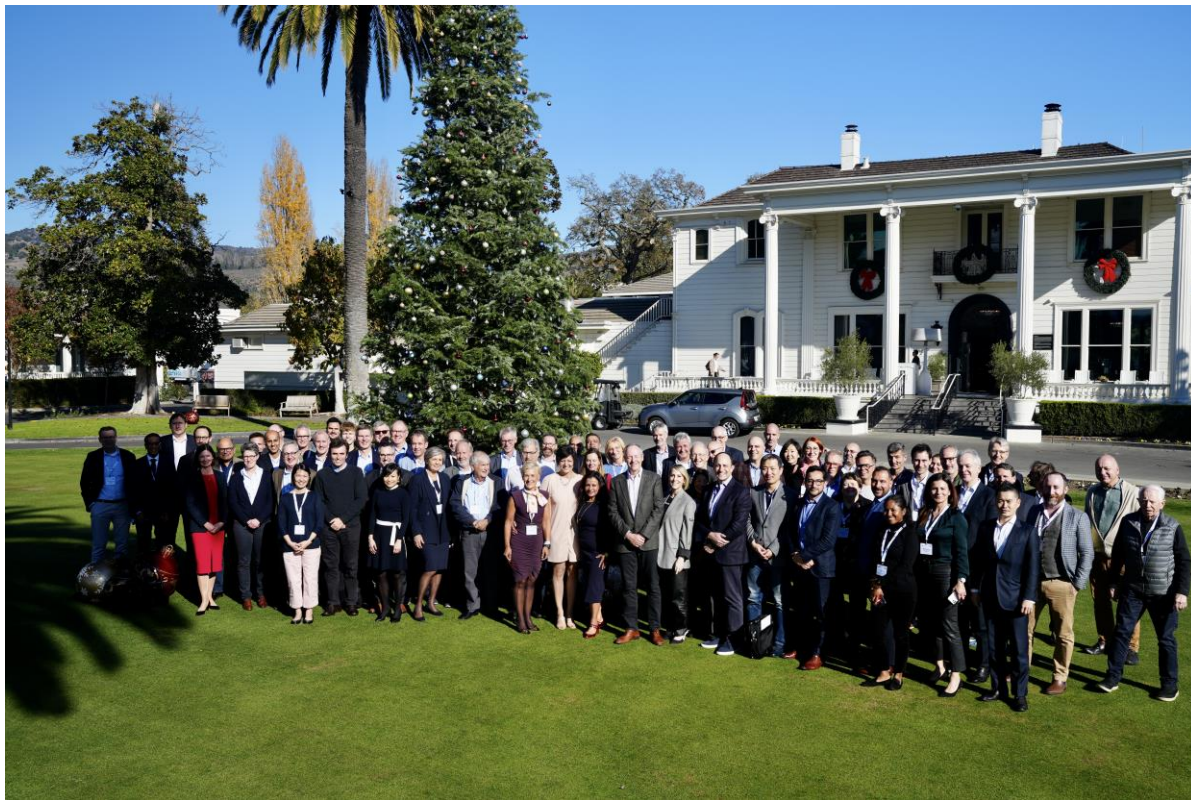
Group picture of delegates AGM 2022 Napa (USA)